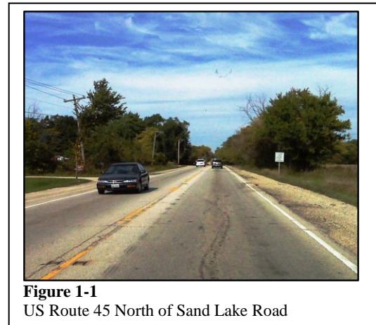
Figure 1-1 US Route 45 North of Sand Lake Road

US Route 45 as well as IL Route 173 and IL Route 132 are classified as Other Principal Arterials and are all under the jurisdiction of the Illinois Department of Transportation (IDOT). All three roadways are also classified as Strategic Regional Arterial (SRA) roadways and are on the National Highway System (NHS). These are roadways one step below the expressway system that typically carry both local and long distance trips, and higher amounts of truck traffic by virtue of their relationship and connection to the regional transportation system. US Route 45 is a designated Class II Truck Route.