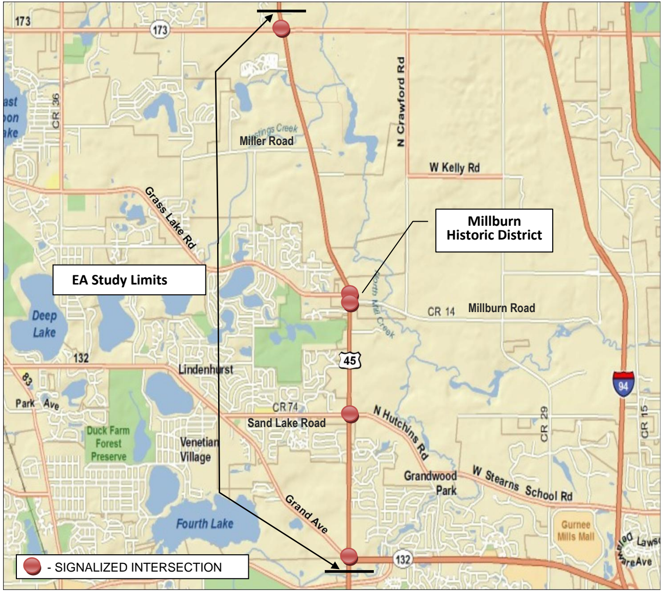
EXHIBIT 1-1 PROJECT LOCATION MAP US ROUTE 45; IL ROUTE 132 TO IL ROUTE 173